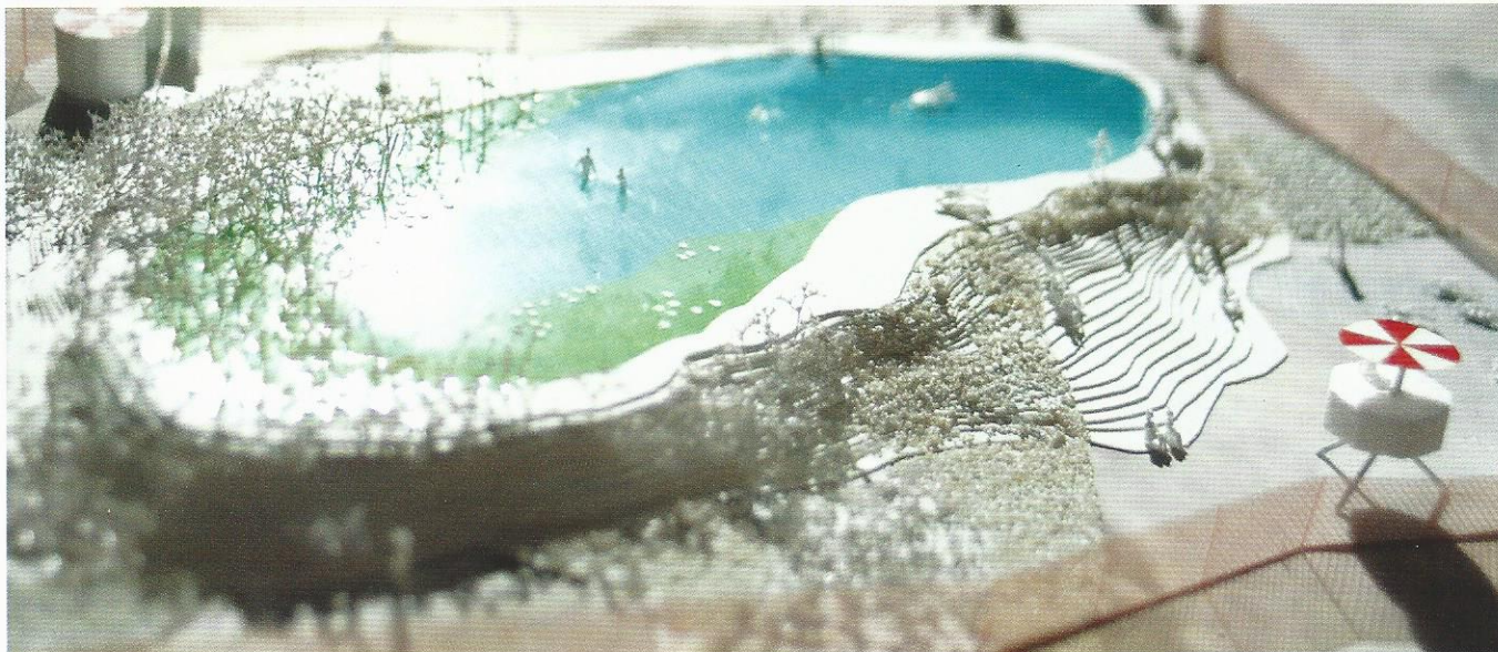
ABOVE: An artist's impression shows how the new natural pool at Kings Cross will look once it is completed at the end of the year.

Work has begun on the UK's first ever public natural swimming pool, as part of an art project within the innovative King's Cross Development.